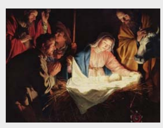
Merry Christmas, Brothers and Sisters 42 comments