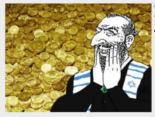
Who Controls Your Mind? 15 comments

Aryan Continence: The Ancient Art of Sexual Restraint 55