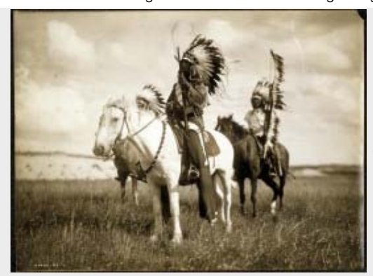
Indian Genocide Mythology 24 comments