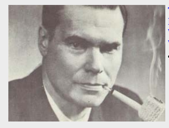
The 35 Most Popular Pro-White Websites 61 comments

Pussy Riot is Not a Band, They are Just Normal Sluts at War with Society 45