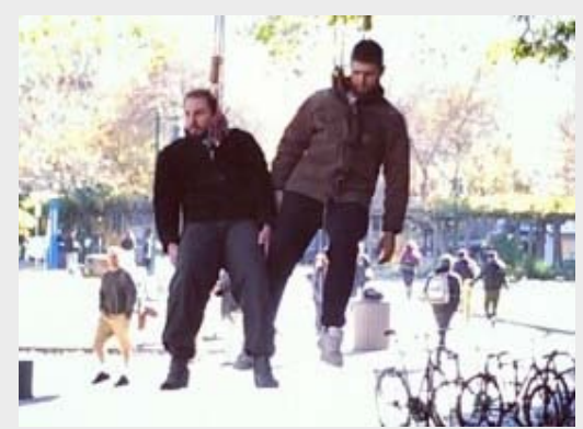
Black Student Lynches 2 White Men Then Calls it 'Art' 15 comments