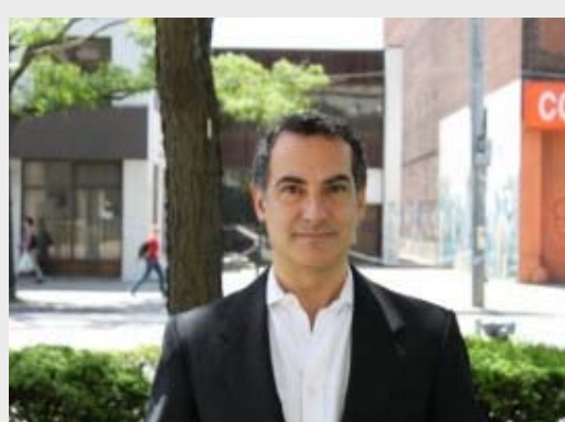
Jewish Press Continues to Humanize Pedophiles 42 comments