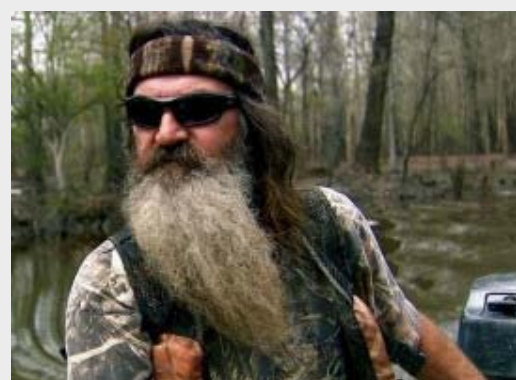
Duck Dynasty: Jewish Hatred for White Christian Society Outweighs Their Love of Money 17 comments