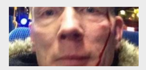
Somalis Playing "Knockout" in Denmark?