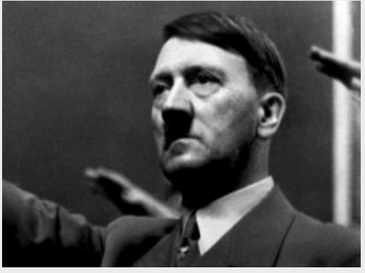
The Development of Western Morality Leads to National Socialism 16 comments