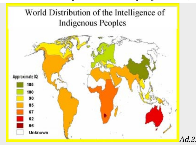
Flawed accusations about hidden authorship

The DCSD committee was divided with respect to the accusation that HN had deliberately disguised the existence of an important co-author (JEV), had secretly used him as a so-called Ghost-writer, or simply had wrongfully claimed sole authorship.