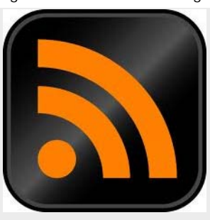
Subscribe to Comments